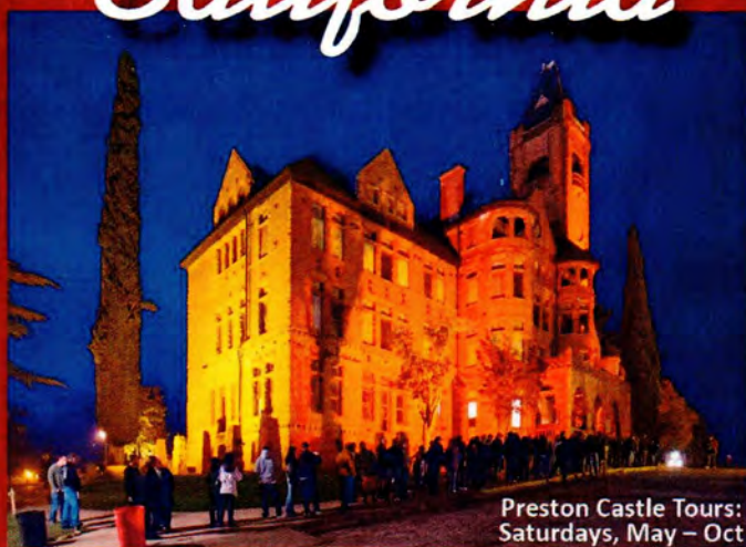
Preston Castle Tours: Saturdays, May – Oct