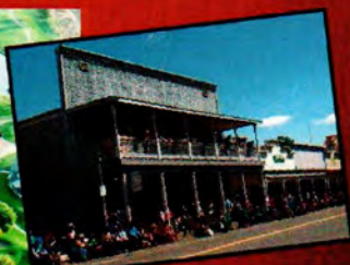
Historic Main Street