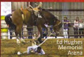
Ed Hughes Memorial Arena