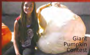
Giant Pumpkin Contest