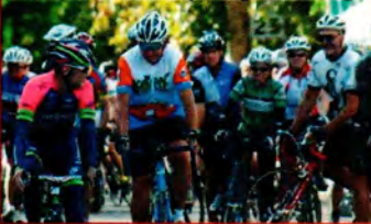
Clark's Corner Cycling Challenge