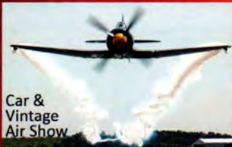
Car & Vintage Air Show